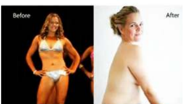
This woman wants to change how we look at our bodies

Ashton Kutcher 26 minutes ago This is good for the world