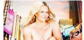
This Mom is Challenging The Way Women See Their Bodies tuffingtonpost.com